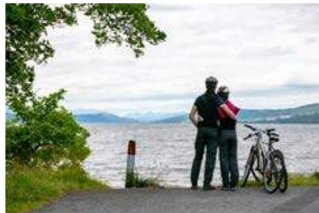
Left: Schiehallion, Rannoch Moor, local walking and cycle paths around Kinloch Rannoch