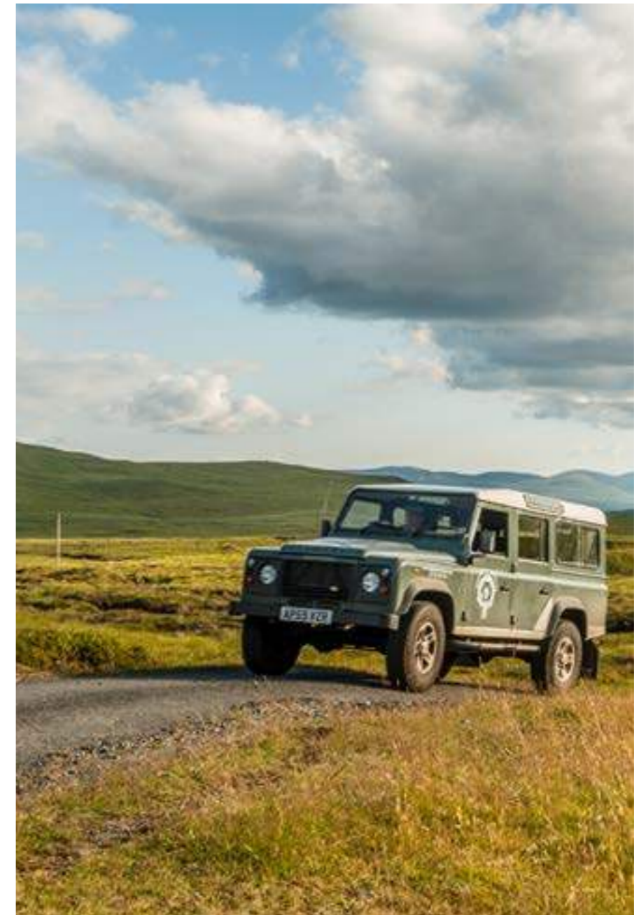
Highland Safaris: see the rugged Perthshire landscape unfold before you

Two themed guides - but speak to the hotel team if you're interested in sport, Scottish history or anything else, and they'll help you research