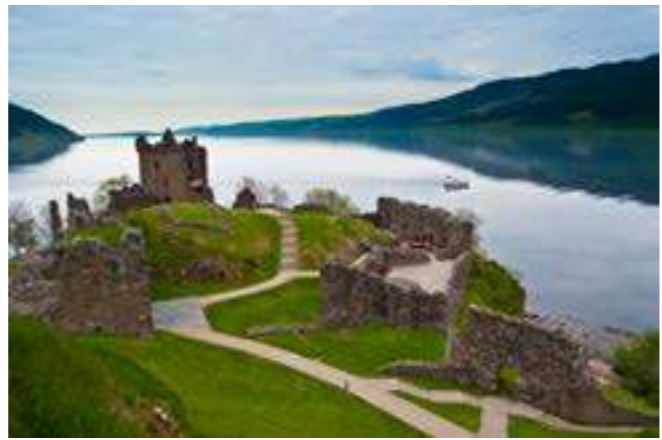
Left: alongside the River Ness in Inverness, a statue of Donald Cameron, the Hogwarts Express, Urquhart Castle