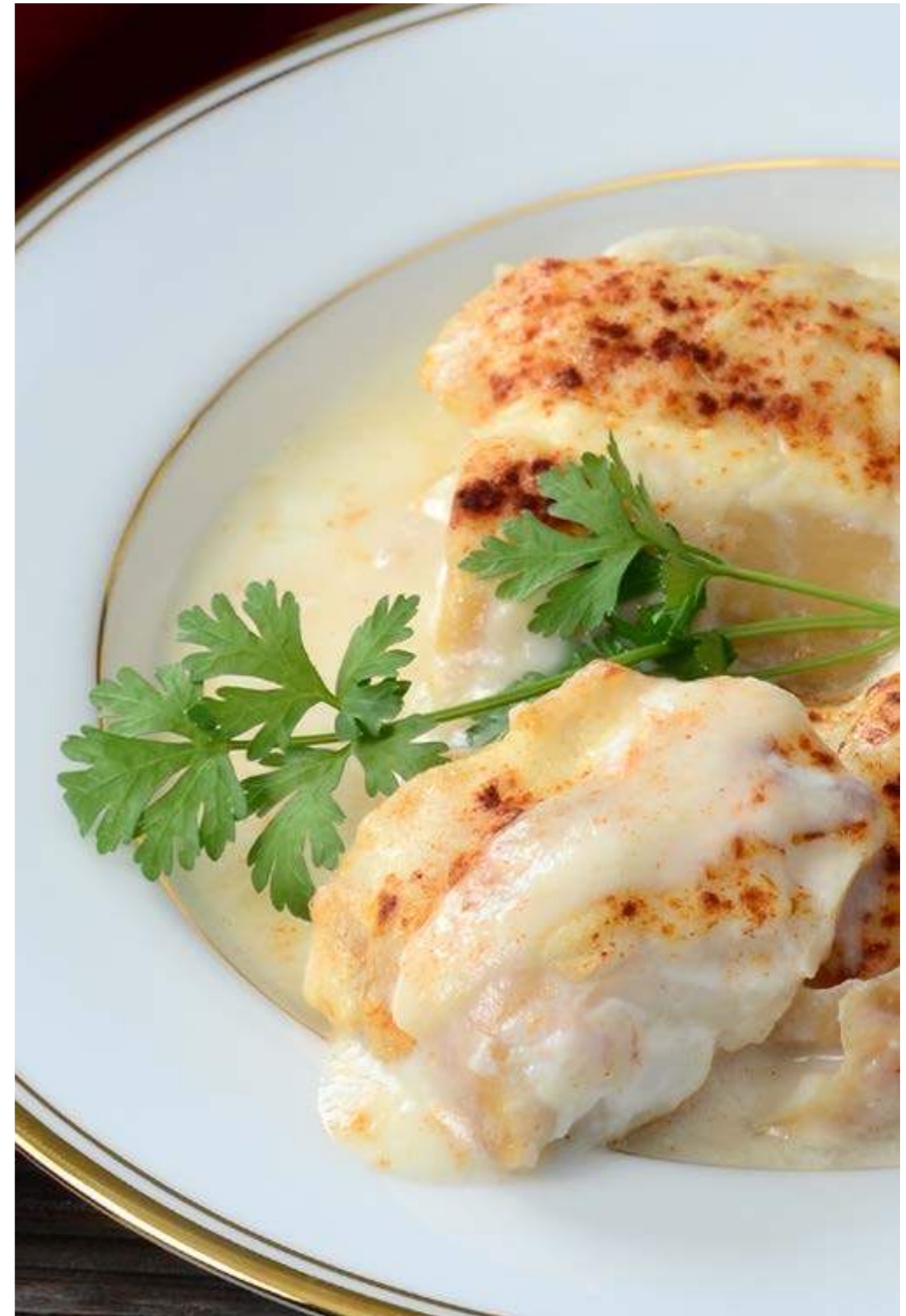
Right: a traditional dish of smoked haddock in a creamy sauce

These are just a few options, and it's always a good idea to check with the restaurant in advance to ensure they can accommodate your specific dietary requirements.