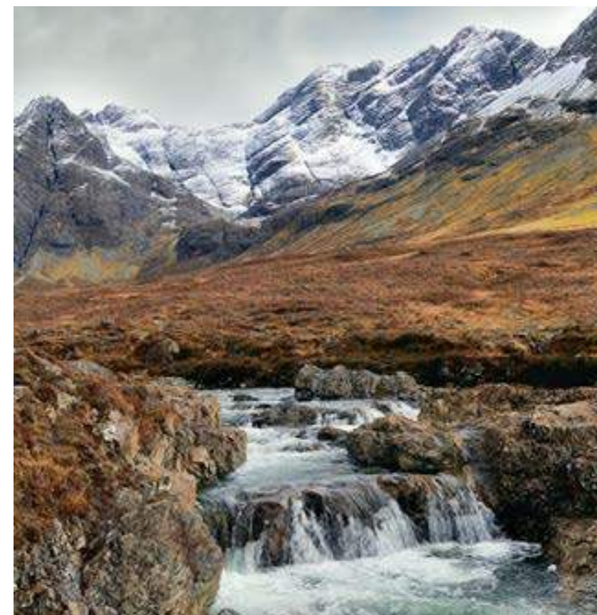
Above and right: Portree at sunset, the fairy pools

These are just a few of the many attractions and natural wonders that the Isle of Skye has to offer. Remember to check the local weather conditions, plan your visits in advance, and follow any guidelines or restrictions in place to ensure a safe and enjoyable experience on the island.