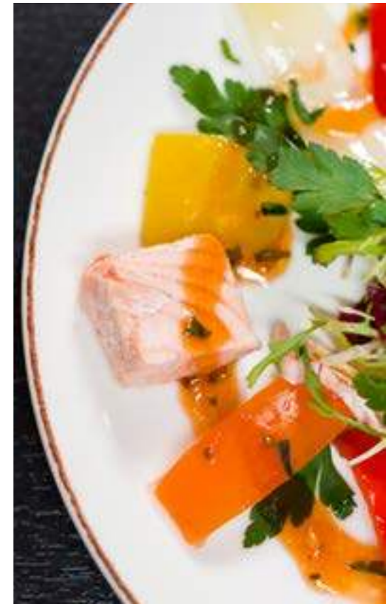
Below: seek out seasonal and local produce for a delicious taste of Scotland

"...a range of cafes restaurants and traditional pubs where you can sample Scottish cuisine. Try local dishes, enjoy homemade treats and savour a wee dram of whisky..."